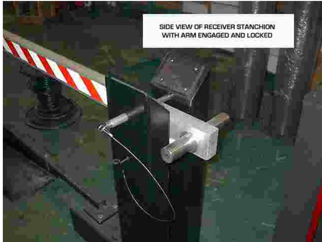
Figure 1-1: Receiver Post Stanchion and Security Latching Pin

Both the hinge post and receiver post are cast in place in a subterranean concrete pour. Both posts have elevation grade locators to aid the installation. The installation requires no above-grade concrete. The portions of the hinge and receiver posts that are imbedded are coated to prevent deterioration due to cement contact. The aboveground portions of the posts are primed and finish painted in black.