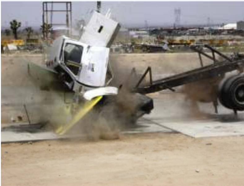
Model 820 Shallow Mount Barrier

* Operating time may be adjusted to suit users' needs. In emergency operation, the barrier can deploy in less than one second.