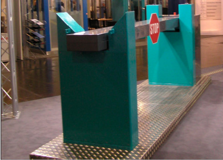
Model 730 Drop Arm Barrier

B&B ARMR's crash beams are available with several enhancement options to easily suit any user's needs. For extremely cold weather, the receiver/latch post may be equipped with a heater for uninterrupted operation, or an electromagnetic lock may be installed for additional security during unattended times.